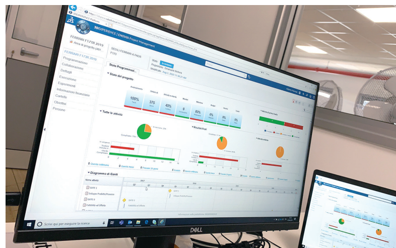
Top image: The 3DEXPERIENCE platform helps Sabelt to achieve a truly connected product development process - from the planning phase all the way through to the manufacturing BOM and beyond, the company now manages all the data in a single environment.